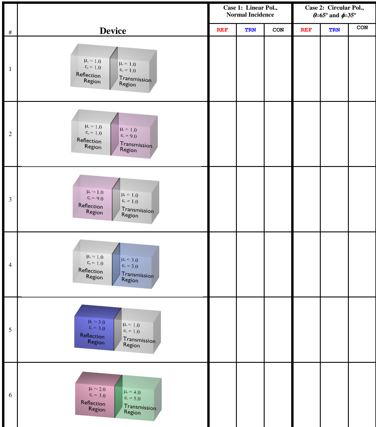
Table continued on next page.

Perform the following simulations and record the reflectance, transmittance, and power conservation for the two cases in the table provided. The first case is a wave at normal incidence. The second case is a circularly polarized wave incident at \theta=65^\circ and \phi=35^\circ .